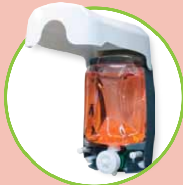
Quick Change Stay Put Cover