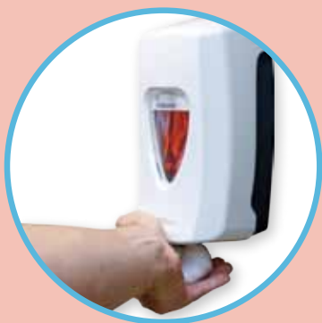
Push Cover Dispensing