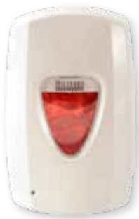
White Dispenser HIL22282