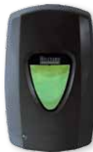
Black Dispenser HIL22283