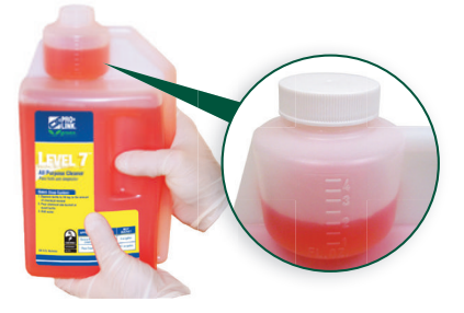
With Quick Dose

The bottle's unique design makes it impossible to bypass the dilution chamber before pouring into the final container.