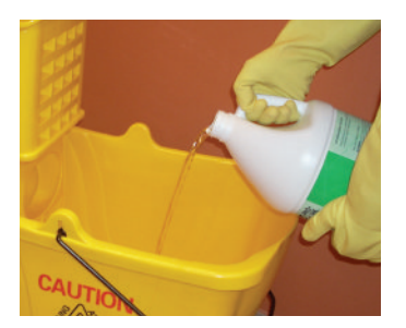
No More "Blind" Pouring

Pro-Link's Quick Dose concentrated chemicals offer a full range of products to meet any facility's general, restroom and hard floor care cleaning needs. Green certified by UL Environment, they also offer an environmentally preferable solution over traditional cleaners. Even the bottle is 100% recyclable, helping your facility meet its recycling goals. Quick Dose is the ideal solution to minimize waste, eliminating the guesswork by staff, ensuring just the right amount of chemical is used. Reducing waste is a great way to lower your facility's total cleaning costs.